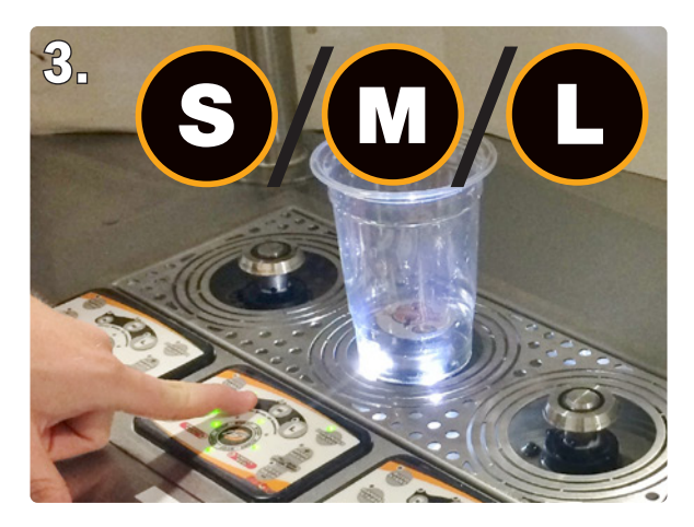
PRESS AND HOLD THE DESIRED POUR SIZE UNTIL BEER STARTS TO FLOW (APPROX. 3 SEC.) THEN LET GO.