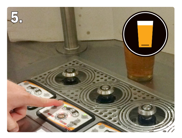
REMOVE CUP, GLASS OR PITCHER AND PRESS THE POUR MODE BUTTON. (REPEAT STEPS 1-5 AS NEEDED FOR OTHER SIZES)