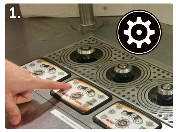
MAKE SURE DISPENSER IS ON, THEN PRESS THE PROGRAM BUTTON.